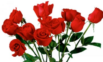
Red Roses, 25 ct. 23" Approximately # 01-4123

Please allow 48 hours advance notice for flower orders.