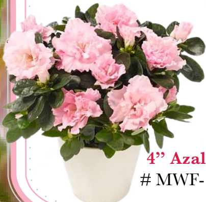
4" Azaleas # MWF-1317