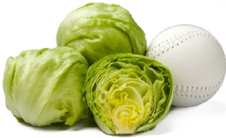
Lettuce, Iceberg Babies 40 ct. Approx. 5" in diameter. # 059700

3100 W. 36th St. Chicago, IL 60632 P: 773-927-8870 | F: 773-927-8718 www.midwestfoods.com