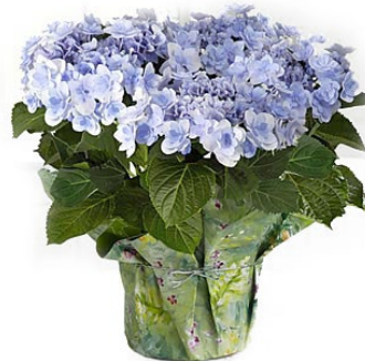
6.5" Hydrangea (Pink, Blue) # 01-2432