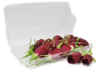
Red Baby Rose, 20 ct. Ornamental *4 Days Notice # 01-11097