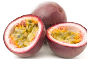
Passion Fruit 10 lbs. # 019000