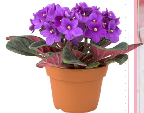
4" Violet # 01-2268