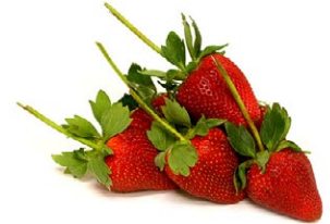
Stem Strawberries 4 - 1 lb. *48 Hours Notice # 923300