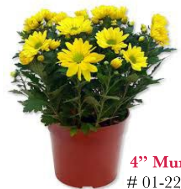
4" Mum # 01-2211